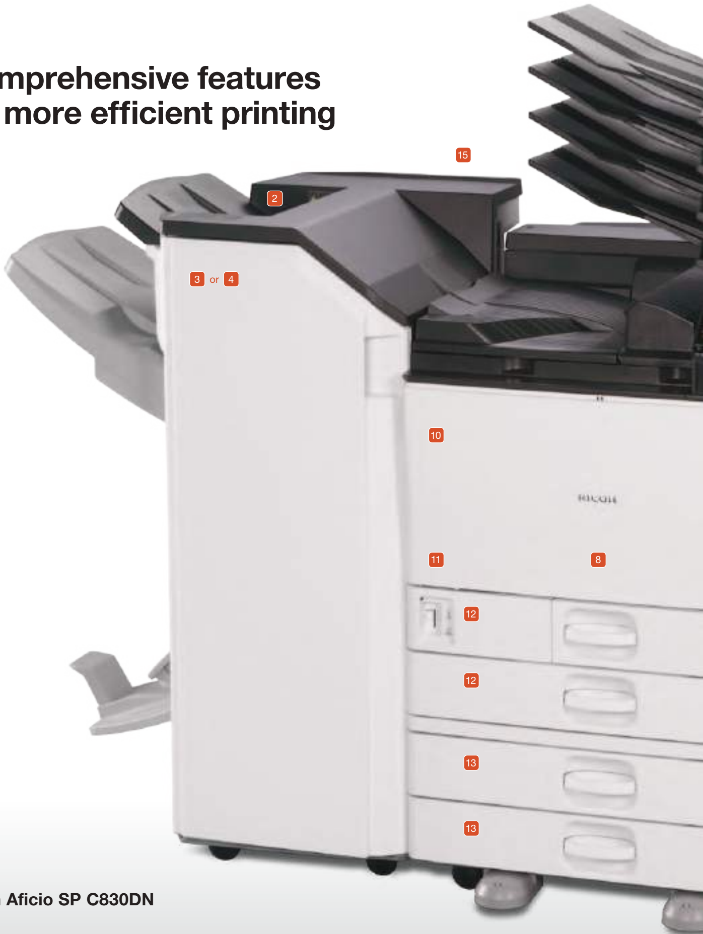
Ricoh Aficio SP C830DN