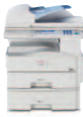
Ricoh Aficio MP 161SPF