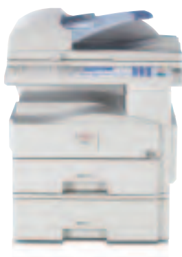
Ricoh Aficio MP 161F