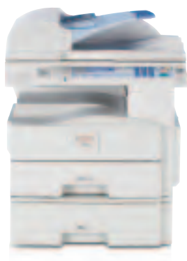
Ricoh Aficio MP 161