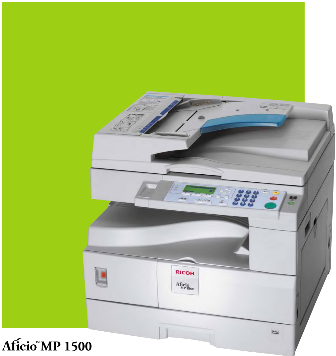
Aficio™ MP 1500